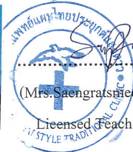
(Mrs.Saengratsmee Panthong )